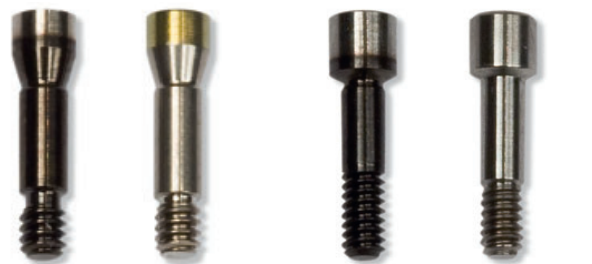
Straumann® Bone Level NC NobelProcera TorqTite screw (left) Standard Straumann screw (right)

Cross-sectional SEM images highlight the precise fit with optimal sealing engagement of the NobelProcera Abutment over the critical interface area of the implant. The abutment interface is designed to create a stable connection and a barrier for preventing bacteria entry. (Enlarged picture to the right is defined by the circle in the left image).