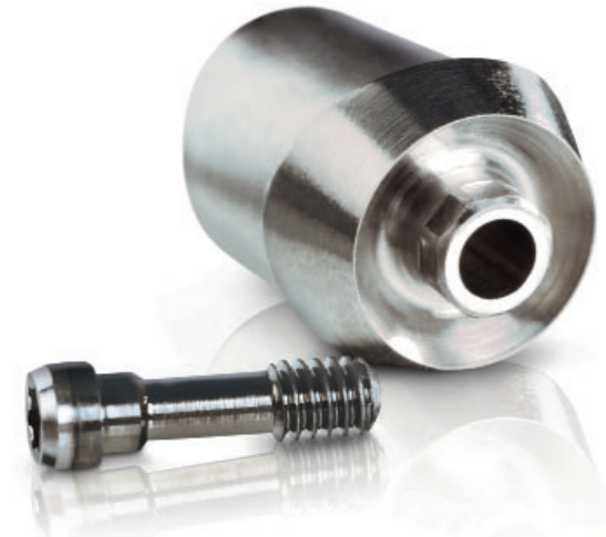
NobelProcera Titanium Abutment for Straumann® Standard Plus 4.8 (RN)

of individualized abutments in the USA.**