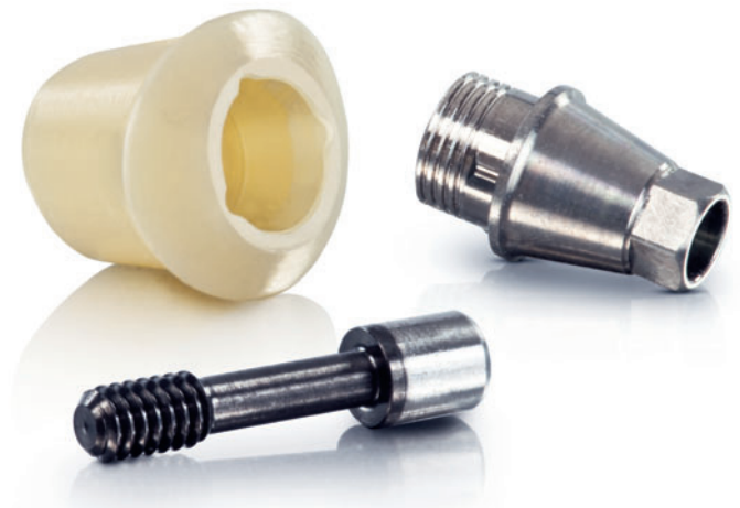
NobelProcera Zirconia Abutment MZ Adapter for other major implant systems: The MZ ("Metal in Zirconia") is an abutment consisting of a CAD/CAM produced zirconia component, a standard titanium MZ adapter and a standard TorqTite clinical screw.