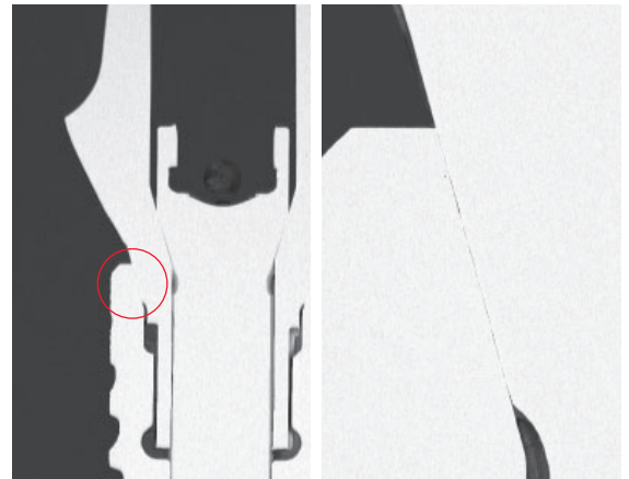
Straumann® Bone Level Platform NC 10 x enlargement (left), 100 x enlargement (right).

Cross-sectional SEM images highlight the precise fit with optimal sealing engagement of the NobelProcera Abutment over the critical interface area of the implant. The abutment interface is designed to create a stable connection and a barrier for preventing bacteria entry. (Enlarged picture to the right is defined by the circle in the left image).